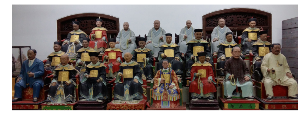
I took this photo at Kek Lok Monastery in Penang, Malaysia. These are approximately 100 centimetre tall statues of the monastery's founding monks and their merchant elite benefactors. They were sculpted between 1897 and 1904 by a sculptor who was commissioned from Fujian Province by the monastery's founding abbot. Most of the benefactors are portrayed in formal Qing court attire, which included dragon robe (chaofu, 朝服), surcoat (bufu, 補服), ceremonial collar (piling, 披領), hat, court beads (chaozhu, 朝珠) and high boots. The surcoat is engraved with an insignia badge on the front and back to indicate the wearer's rank. Many of the statues include sculpted hats, modeled on the black, sealskin ones worn by Qing officials during the winter season. A few of the hats have a finial (dingdai, 頂戴), or hat button, which was either solid red, representing a rank of the second grade, or gold, which was worn by officers who held a rank graded between

My findings offer new insight into the life of Chinese Buddhism as manifested in its monastic institutions and their supporting communities. By focusing on the expansion of a Chinese Buddhist monastery abroad, I provide a novel perspective on overseas Chinese religiosity and its role in the construction of Buddhist modernism and Chinese nationalism. My research also contributes to scholarship on religion and diaspora, pilgrimage and tourism and migration and sacred space. I am thrilled to have the opportunity to share my findings and learn from the community of scholars and artists at CSRS.