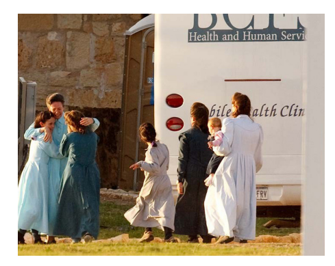
San Angelo, Texas

kindly with both those currently growing up in alternative religions as well as those who have left. My thesis is based on life history interviews with adult former members from various alternative religions. Without robust research from their own field, helping professionals tend to really on information gleaned from popular media, which often portrays those involved with alternative religions as in need of rescuing or curing. By hearing directly from those raised in alternative religions, it is my hope to break down stereotypes, challenge assumptions and move towards a more respectful framework of care that is grounded in the lived experiences of those involved with alternative religions.