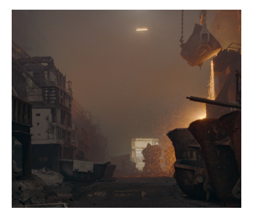
Smelting operations at NorNickel factory, Norilsk, Russia

Workers in underground potash mine in Berezniki, Russia 2018