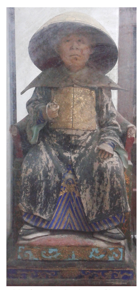
Male benefactor—This is the male version of the statue.