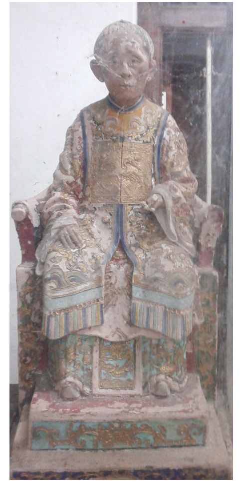
Female benefactor—I took this photo at Kek Lok Monastery.